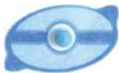
Blue CT Markers