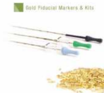
Gold fiducial markers